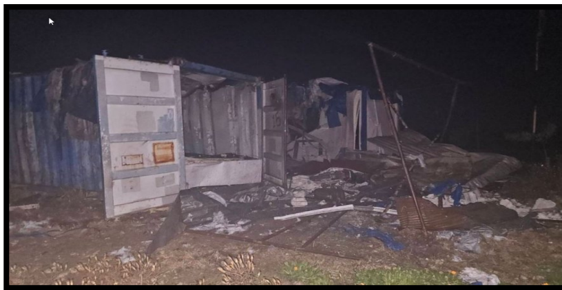
Kobani's western entrance 26th of December 2023

Amuda city: December 26, at 6:49 pm, Turkish forces' drones bombed two checkpoints belonging to the Internal Security Forces at the eastern and southern entrance to the city, causing material damage.