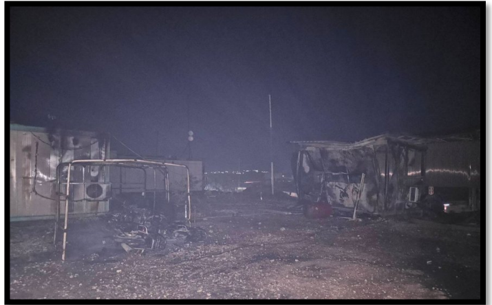
Kobani's southern entrance 26th of December 2023