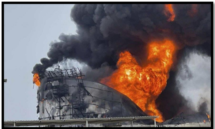
Oda oil station Tirbespiyeh 23rd of December 2023