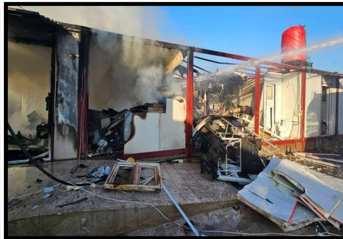
Covid 19 hospital-Kobani 25th of December 2023

As for the city of Qamishli , the number of air strikes reached 31 by warplanes and drones, and the strikes focused on vital centers and the service and industrial facility, which is the Satcob fuel station, a warehouse for consumer materials, an industrial facility, a construction company, SEMAV Printing company, Covid-19 hospital, a power station, a cement factory, a livestock fodder warehouse. Kidney dialysis hospital, a grain factory, the Martyrs' graveyard, a construction warehouse, a gas station for farmers, garages, a cement warehouse, a mill, the local market, and a detergent factory, which caused material damage, some of which were out of service. The number of martyrs as a result of the air strikes reached 8 martyrs and 14 wounded, including in Critical condition.