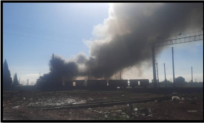
Train station -Qamishli 25th of December 2023