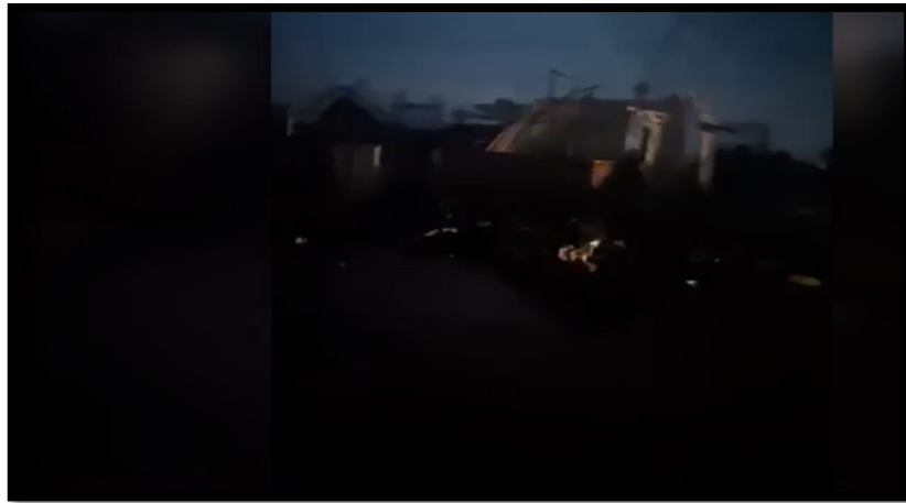
Anuda's eastern entrance 26th of December 2023

Tal Tamer town: December 26, at 5:31 pm, a Turkish forces drone targeted the village of Al-Tawila in the western countryside of Tal Tamr district, without reporting any damage.