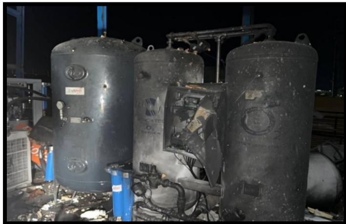
Medical Oxygen factory - Qamishli 25th of December 2023