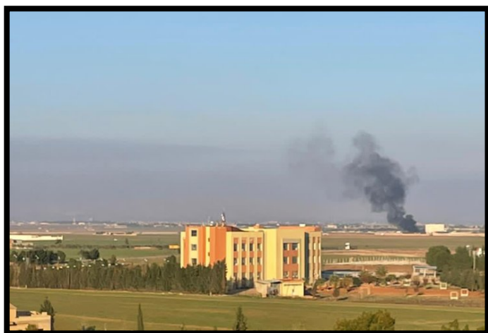
Joudy wheat factory Qamishli 26th of December 2023

The city of Qamishli: December 26, at 3:53 p.m., Turkish forces aircrafts targeted an Internal Security Forces point near the village of Haram Sheikho, in addition to an air strike on a construction company and another strike on a wheat factory in the town of Karbawi in the city of Qamishli at 4:15 p.m., after two hours of bombing. First on the security points, Turkish aircraft resumed bombing the Al-Naamtli checkpoint of the Internal Security Forces, in addition to targeting the Al-Alaya neighborhood in the city at 5:18 p.m.