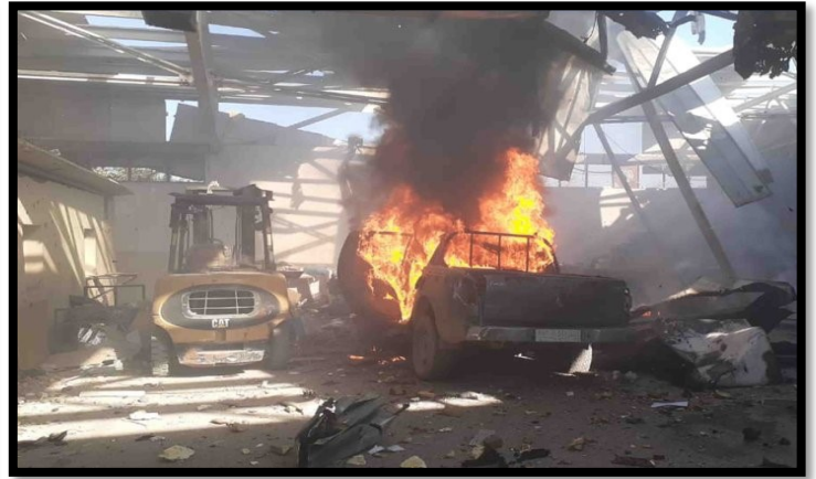
Simav printing shop 25th of December 2023