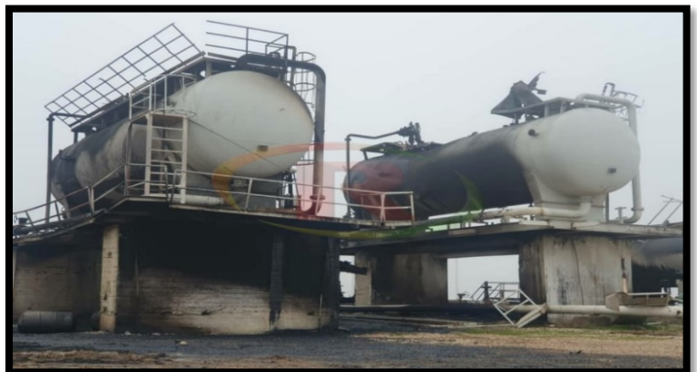
Saeeda oil station-Tirbespiyeh 23rd of December 2023