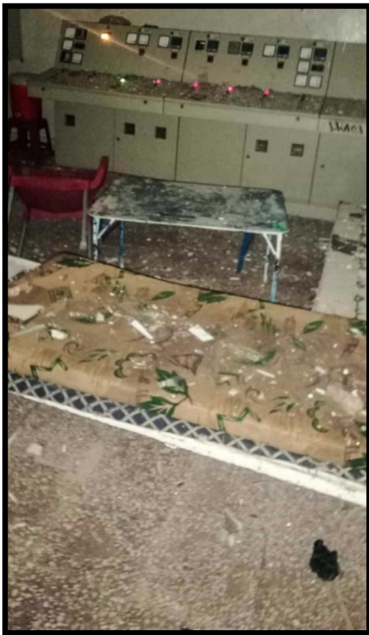
The Electric station- Bana Shekaft- Derik 23rd of December 2023

On December 23 , warplanes targeted vital centers and an energy service facility in the cities of Derik and Terbespiyeh , with the number of air strikes reaching 15. They targeted Al- Oda Oil Facility, the Saeeda Oil Facility, an energy service facility, an agricultural bank, and a plastics factory, causing human and material damage, as civilians were injured. As a result of the bombing and strikes, the aforementioned centers were completely out of service.