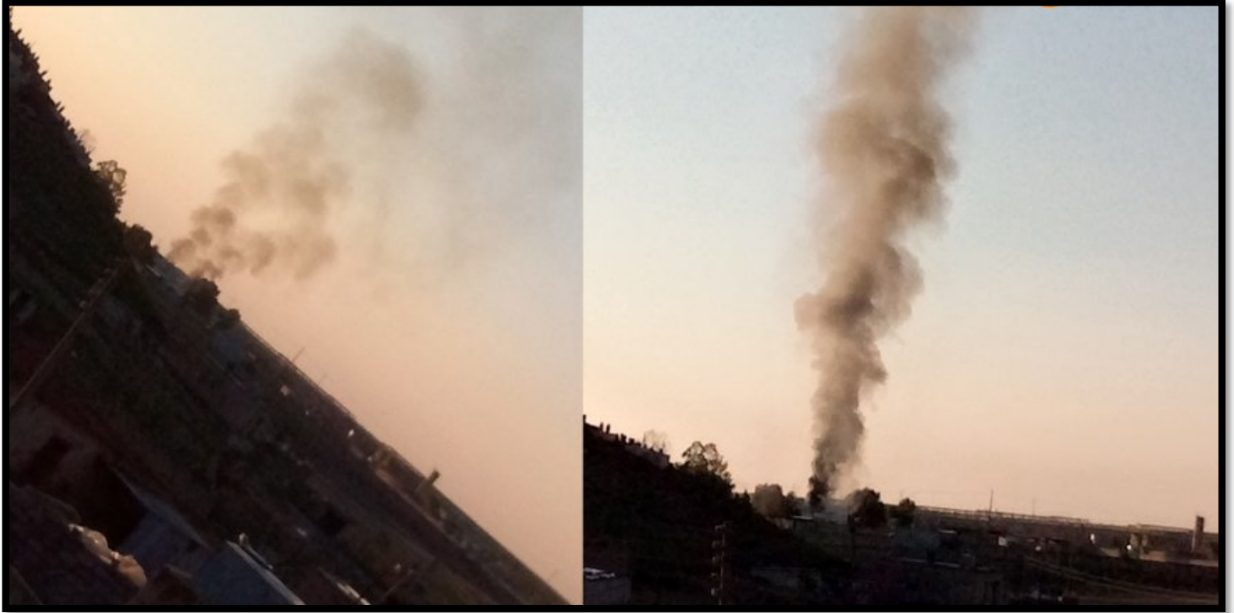
Grains silos of Twaiba village Girke legi 26th of December 2023

Girke Legi district: December 26, at 3:29 pm, heavy artillery of the Turkish forces targeted with several shells the vicinity of the grain silos in the village of Tuiba, causing material damage.