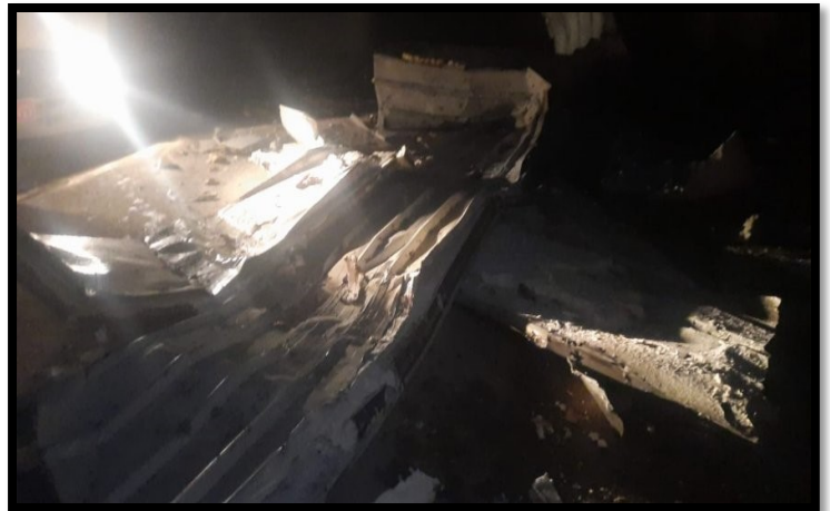
Farmers fuel station Qamishli -25th of December 2023