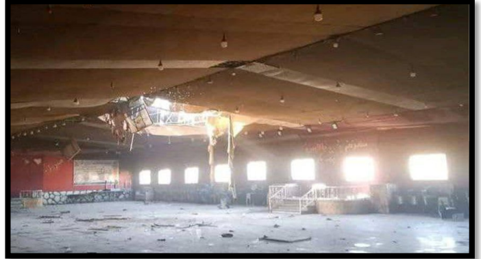
Karam wedding hall -Amuda 25th of December 2023