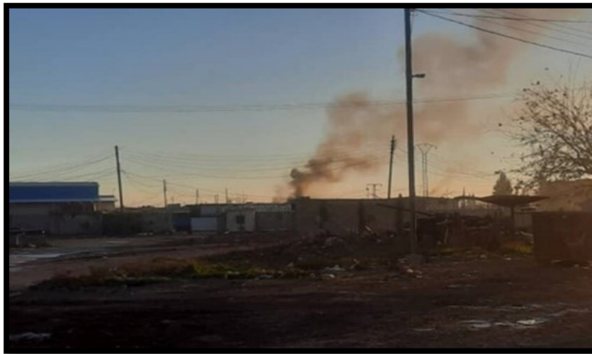
Grains factory - Amuda 25th of December 2023