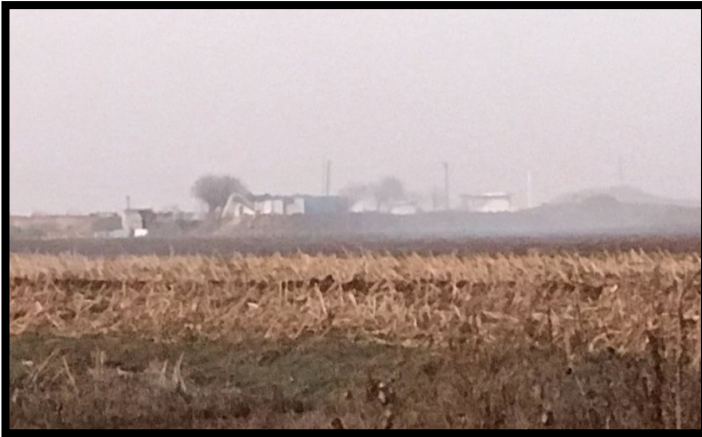
Kobani's eastern entrance 26th of December 2023

City of Kobani: December 26, at 5:43 pm, a Turkish forces drone targeted two Internal Security Forces checkpoints at the eastern and western entrances of the city, causing material damage. At 6:30 pm, the drones targeted a security checkpoint at the southern entrance to the city, and resumed bombing the security checkpoint. To the western entrance to the city at 7:10 pm, thus targeting all security entrances of the Internal Security Forces in the city. At 7:29 pm, drones belonging to the Turkish forces simultaneously bombed 3 checkpoints of the Internal Security Forces on the eastern side of the city, causing material damage.