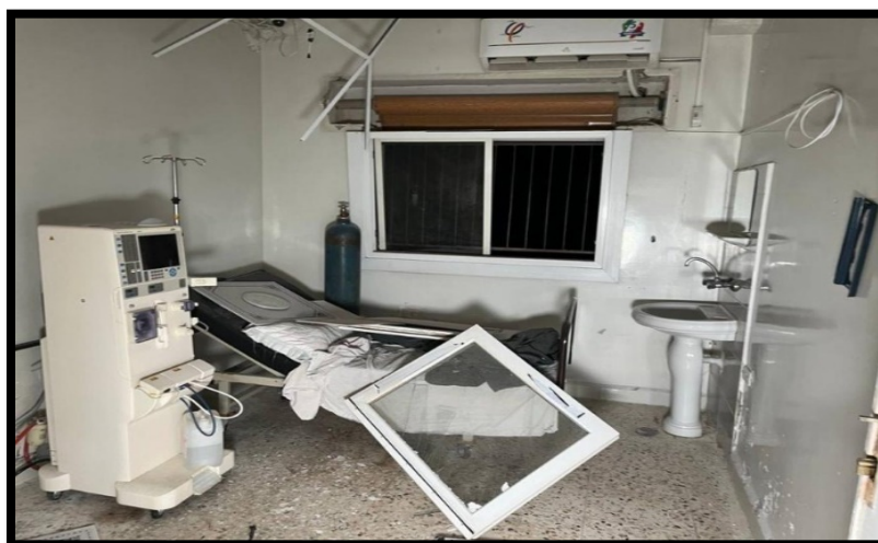
Kidney dialysis hospital 25th of December 2023