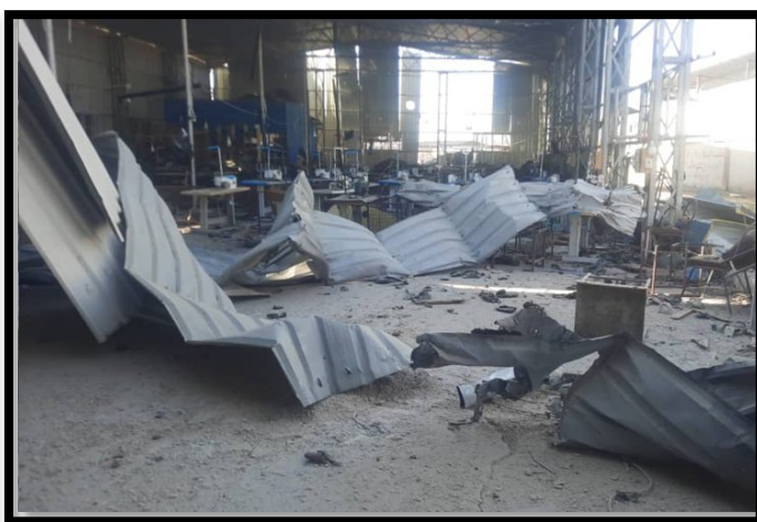
Sewing shop-Qamishli 25th of December 2023