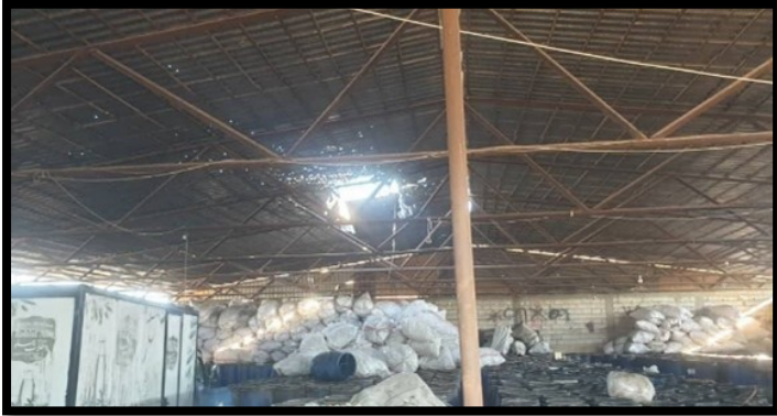
Rojhelat olive factory Amuda 25th of December 2023

The number of air attacks on the city of Amuda reached 3 drones air strikes. The strikes focused on civilian property and agricultural centers, including a wedding hall, an olive factory, and a grain factory, which caused material damage.