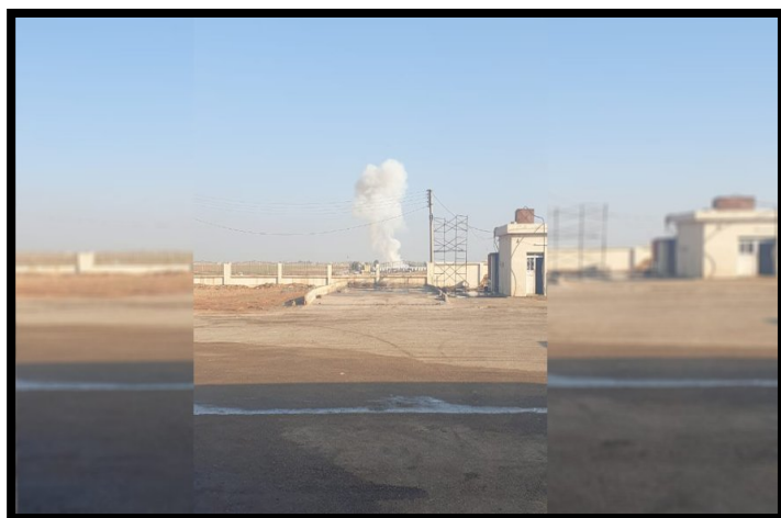
Traffic security checkpoint Qamishli 26th of December 2023