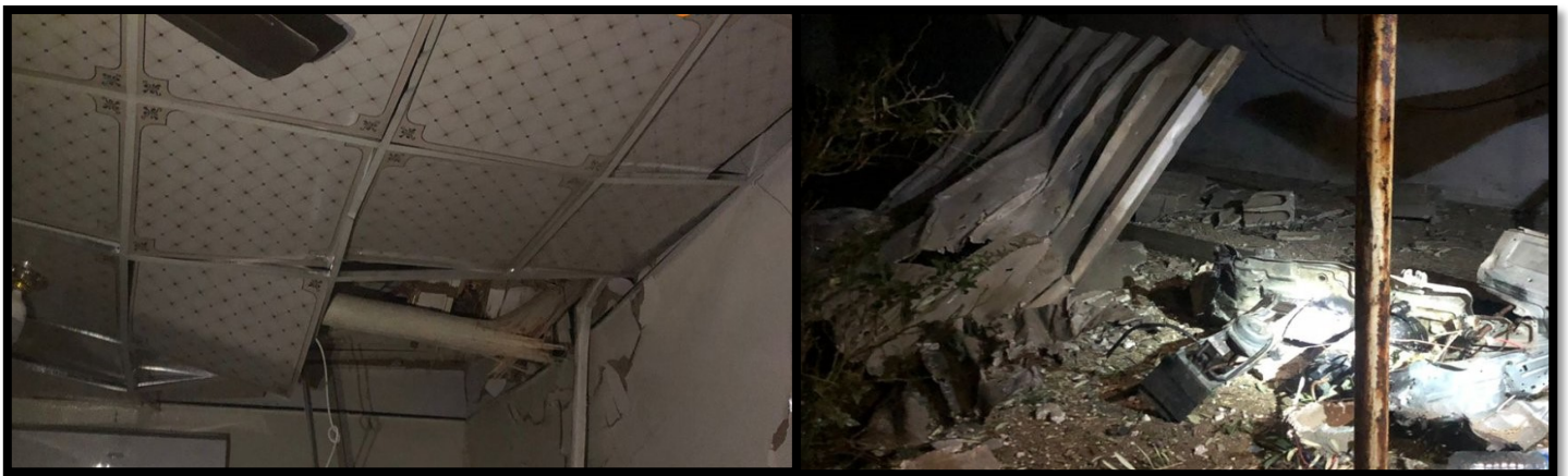
The targeted house of the civilian Asraf Kaya Derbassiyeh 26th of December 2023

City of Darbasiyah: December 26, at 7:23 pm, drones targeted the homes of two civilians, causing material damage.